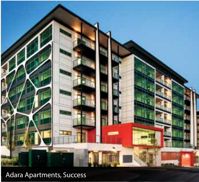
Adara Apartments, Success