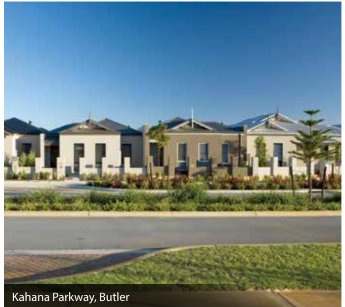
Kahana Parkway, Butler

More information at www.housing.wa.gov.au