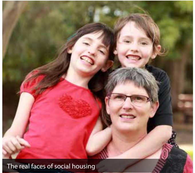
The real faces of social housing