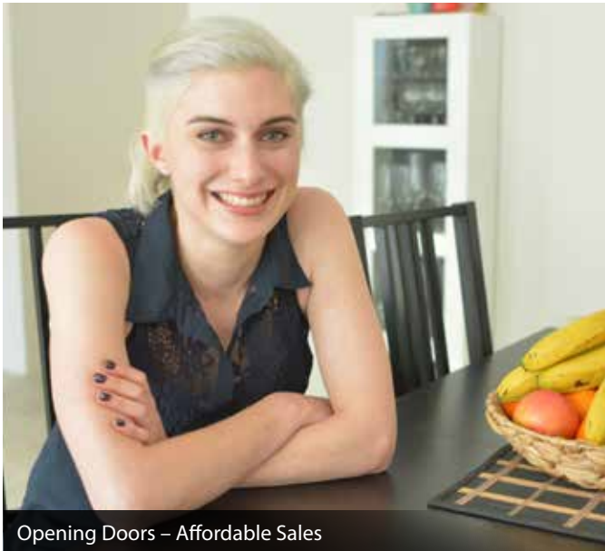
Opening Doors – Affordable Sales